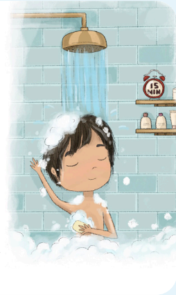
Answer: 15-minute shower

Which uses more water: a 3-minute shower or a 15-minute shower?