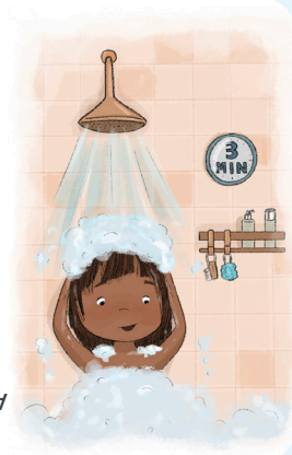
Answer: 3-minute shower

Which uses less water: a 3-minute shower or a 15-minute shower?